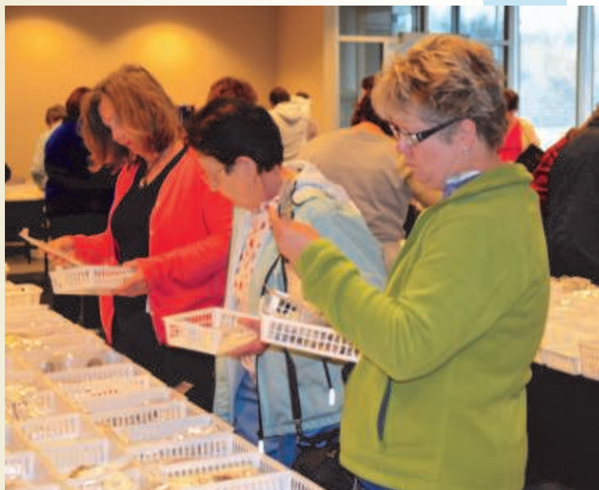
Many people took advantage of the vast selection of $5.00 items at the CRMC Auxiliary Masquerade Jewelry sale last spring. The event raised over $1,700 for the Auxiliary. They will be hosting another $5.00 Jewelry Sale on Wednesday, October 3rd, from 11:00 a.m. to 5:30 p.m. in the CRMC 1st Floor Conference Room.

The Auxiliary will host another Masquerade $5.00 Jewelry Sale on Wednesday, October 3, from 11:00 a.m. to 5:30 p.m. The event is free to attend and open to the public.