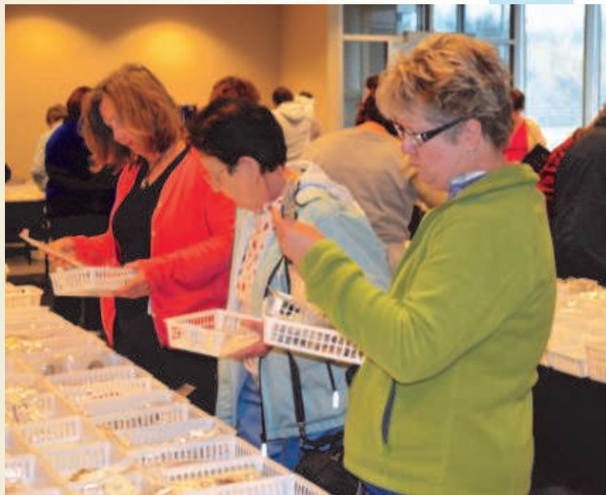
Many people took advantage of the vast selection of $5.00 items at the CRMC Auxiliary Masquerade Jewelry sale last spring. The event raised over $1,700 for the Auxiliary. They will be hosting another $5.00 Jewelry Sale on Wednesday, October 3rd, from 11:00 a.m. to 5:30 p.m. in the CRMC 1st Floor Conference Room.

The Auxiliary will host another Masquerade $5.00 Jewelry Sale on Wednesday, October 3, from 11:00 a.m. to 5:30 p.m. The event is free to attend and open to the public.